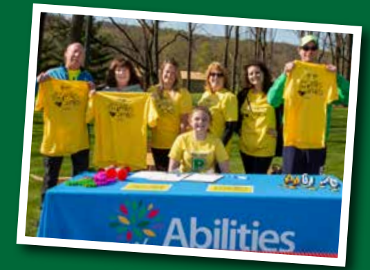
Abili-Tees Invitational Golf Outing held on June 27th at Panther Valley Golf & Country Club- raised nearly $28,000

Sterbenz Miles of Smiles 5k Fun Run • 1k Walk/Roll/Stroll held on April 30th on The Community Trail at Warren Community College- raised nearly $17,000