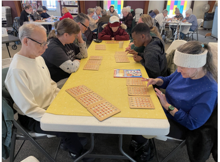
Bingo at the Senior Center