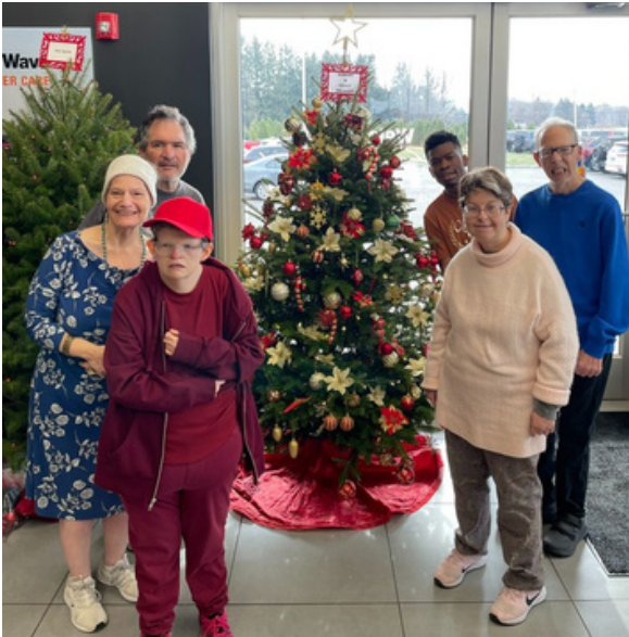
Decorating the tree for this year's Festival of Trees